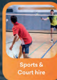
Sports & Court hire