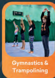
Gymnastics & Trampolining