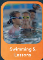
Swimming & Lessons

We have activities to suit all abilities, from making a splash in the pool, to learning to swim, working out in the gym, having fun in our soft play area and more. There's something to suit everyone here!