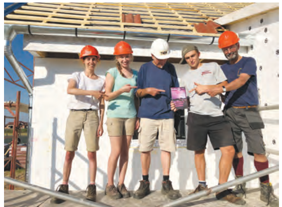
The team of housebuilders in Romania, from All Saints Church