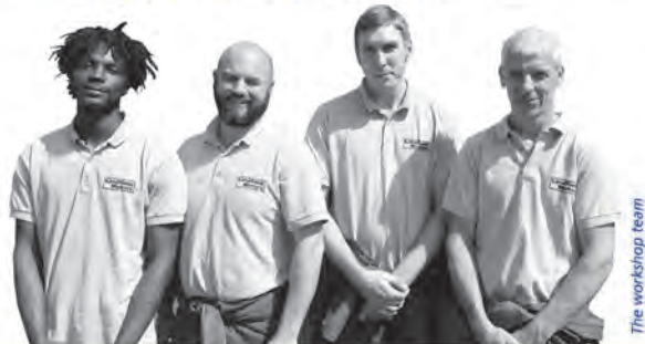
The workshop team

"Many people in the village have used us for years, why not join them?"