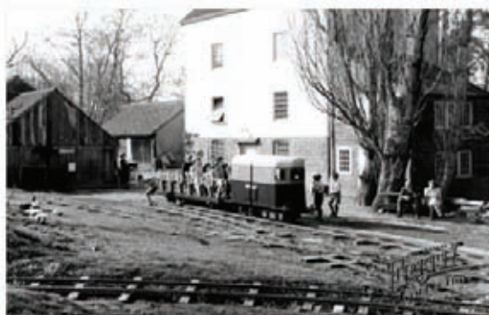
Lindfield, the Tudor Barn, Mill and Railway c1955 Ref: I221018